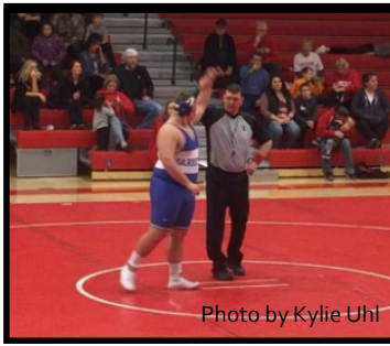
Wrestlers had a successful joint "home" meet last Saturday with Brandon. They are back in action tonight in Tri-Valley.